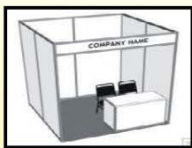
EXHIBIT PACKAGE: BOOTH Php 40,000 plus VAT

Inclusions: Standard booth amenities: table and chair, fluorescent lamp, duplex outlet, Event Staff I.D, Overall janitorial, security and administrative services